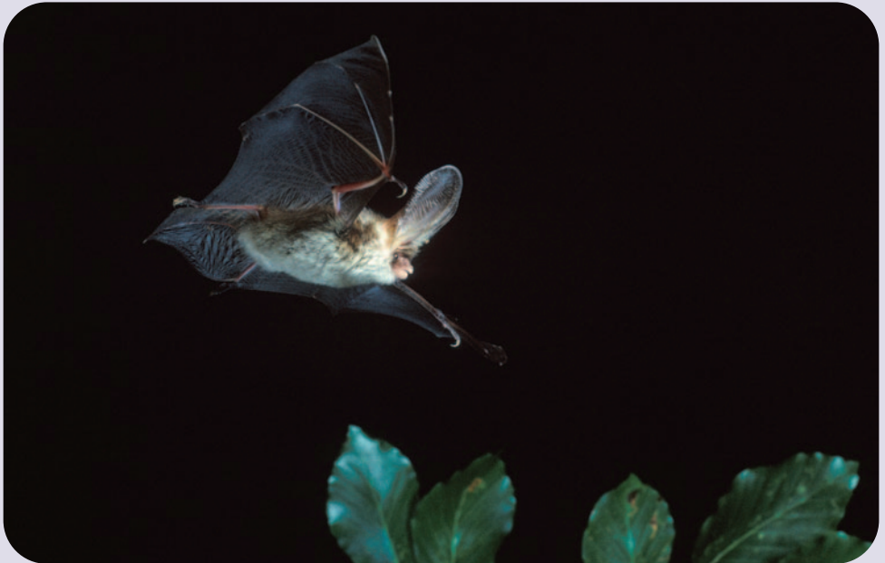
Brown long-eared

A guide for bat-friendly gardening and living